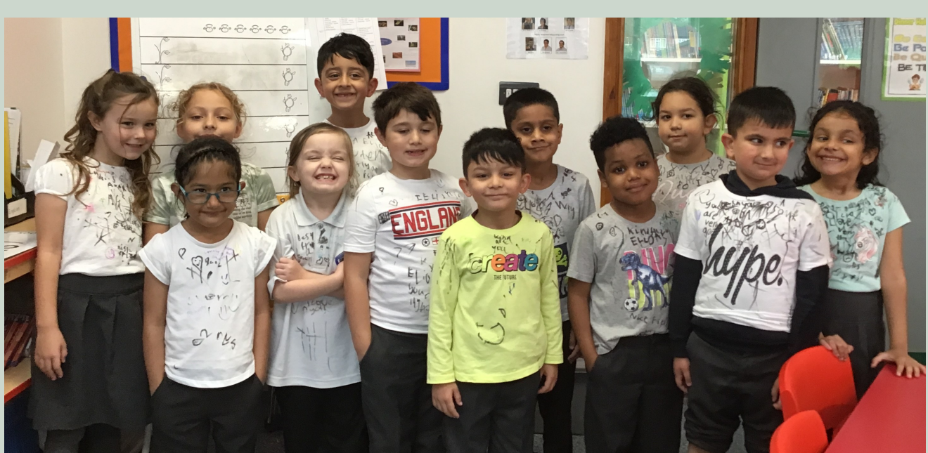
Compliments Day Children wrote compliments on their friends' T-shirts.