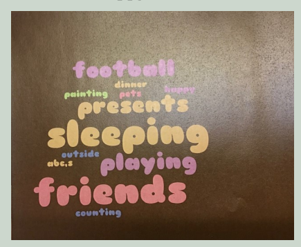
Year 1 made a wordle of all the things that make them happy.